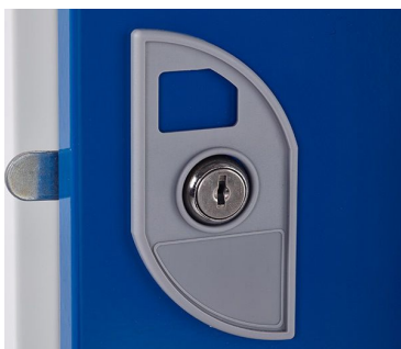
Cam lock - supplied with 2 keys