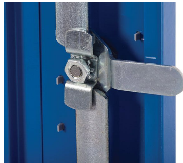
3-point locking mechanism